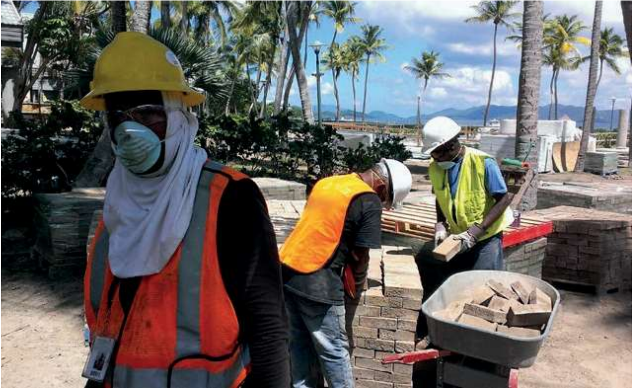
The worlds' workers are a key in climate adaptation.