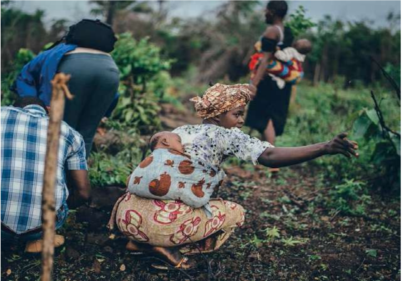
Hard and strenuous work is commonplace for many women.