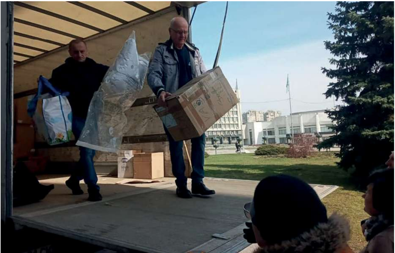
Medical products via the Palme Center to Ukrainian hospitals.

The LO Executive Council decided immediately after the invasion to donate SEK 250,000 to start with to the Palme Center's Ukraine fund-raiser. It will be followed by additional support. And all over Sweden, national