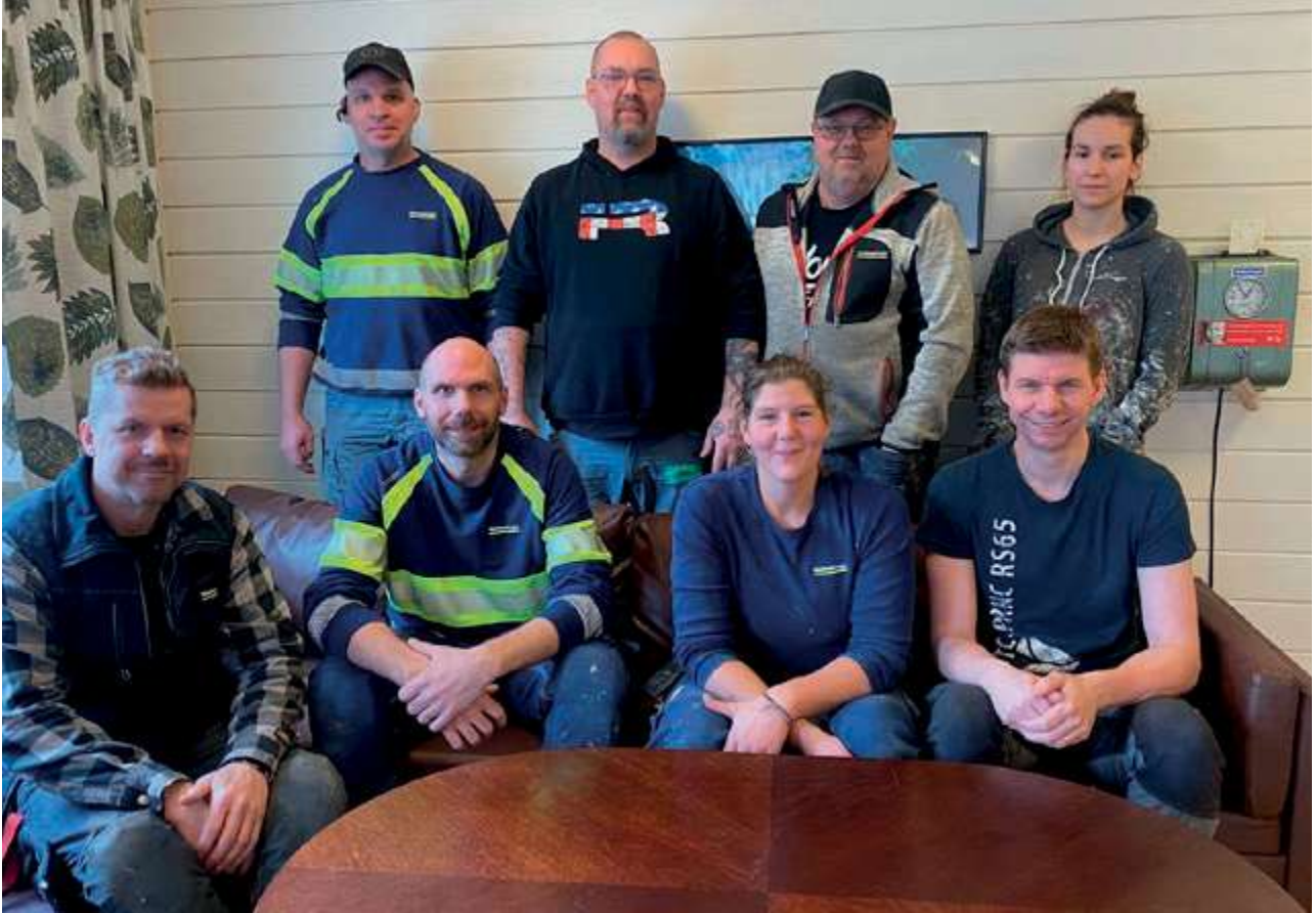
GS members at Väst kuststugan in Mjölby emptied their entire club fund for Ukraine.